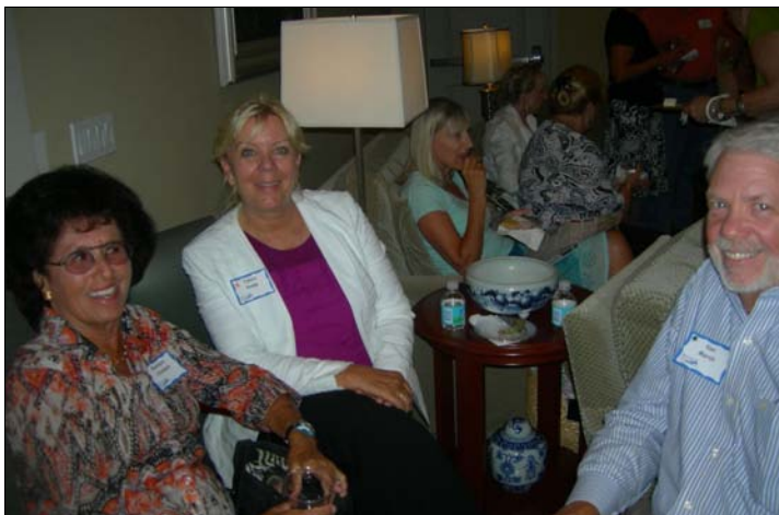
One of many small conversation groups at "Wine, Cheese & Politics" in July.